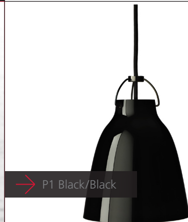
→ P1 Black/Black