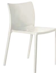
Matt colour White 1730 C