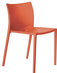
Matt colour Orange 1086 C