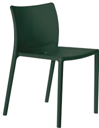
Matt colour Dark Green 1554 C