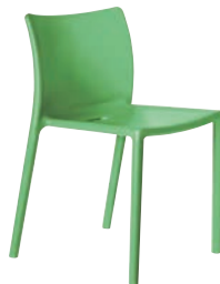
Matt colour Green 1320 C