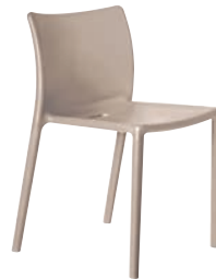
Matt colour Beige 1450 C