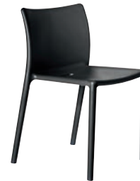
Matt colour Black 1751 C