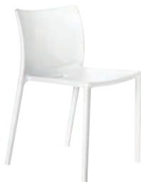
Matt colour Pure White 1690 C