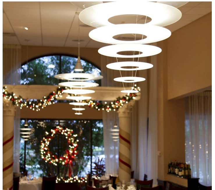
CASA D'ANGELO, FT LAUDERDALE, FL