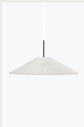
Item No: 22210 Variant: Large Ø500-900