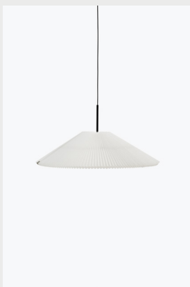
Item No: 22220 Variant: Small Ø400-700