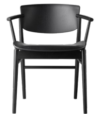
BLACK COLOURED OAK