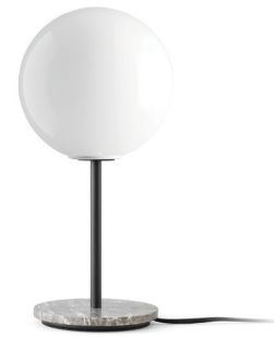
Ocean Grey Marble, Shiny Opal Bulb 1491629