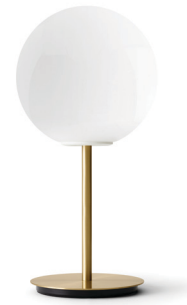
Brushed Brass, Shiny Opal Bulb 1461629