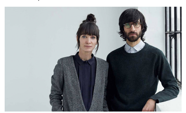
DESIGN GamFratesi, 2013

With Suspence™, the Danish-Italian design duo GamFratesi have created a lamp where aesthetics, functionality and luxury meet. The inspiration for the lamp series was the translation of a movement into a physical form and the shape of the lamp has been created by a soft pull, visually and physically connecting the cord with the shade. An infinity diffuser at the bottom of the lamp concentrates the light, prevents glare and creates an elegant optical illusion.