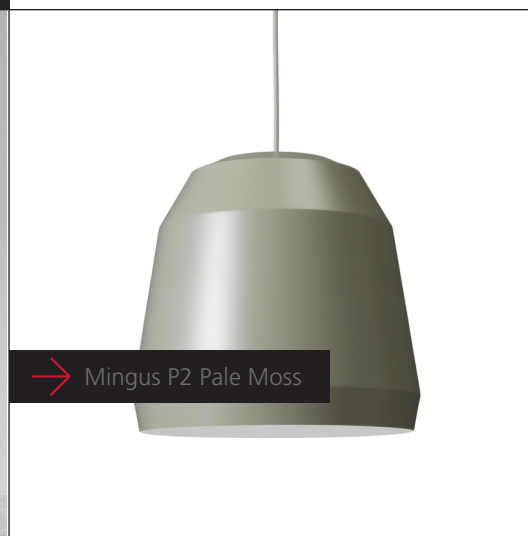
→ Mingus P2 Pale Moss