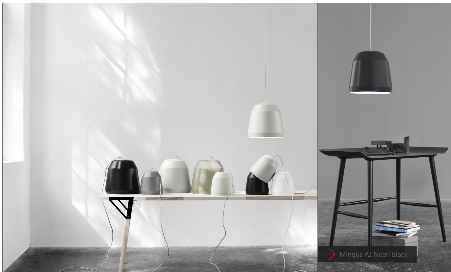
→ Mingus P2 Near Black