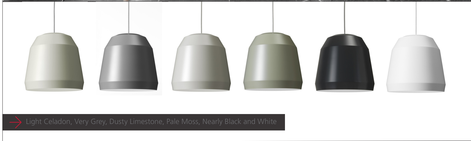
→ Light Celadon, Very Grey, Dusty Limestone, Pale Moss, Nearly Black and White