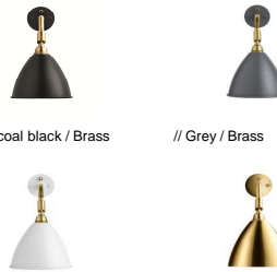
// Charcoal black / Brass