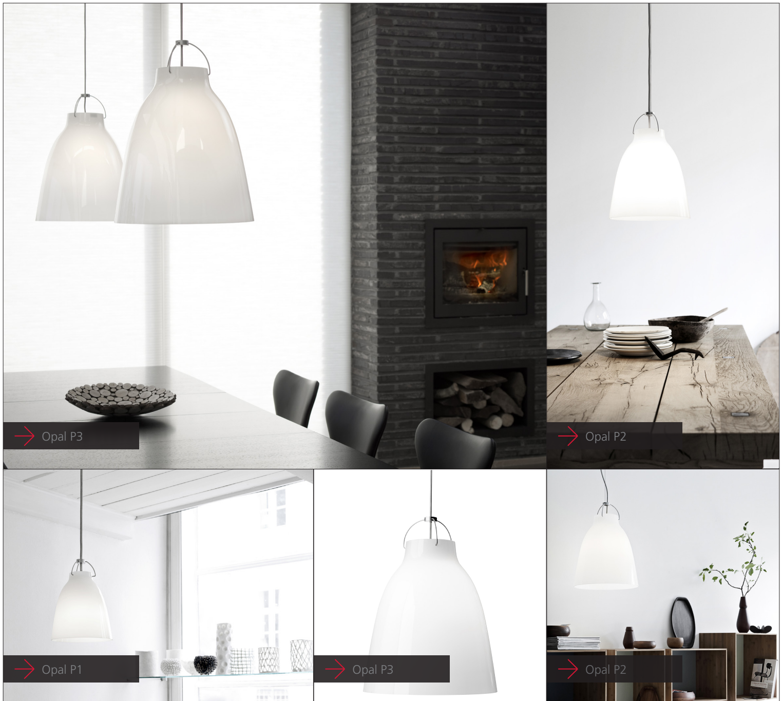
→ Opal P3